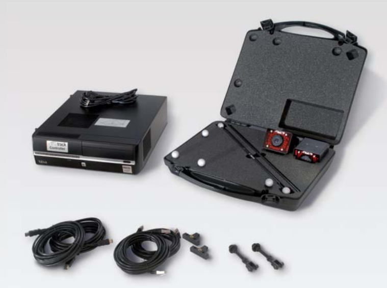
Scope of delivery